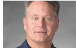
Webinar on U.S. Economic Outlook | p. 4