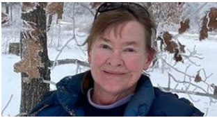
New Board Member Profile | p. 2